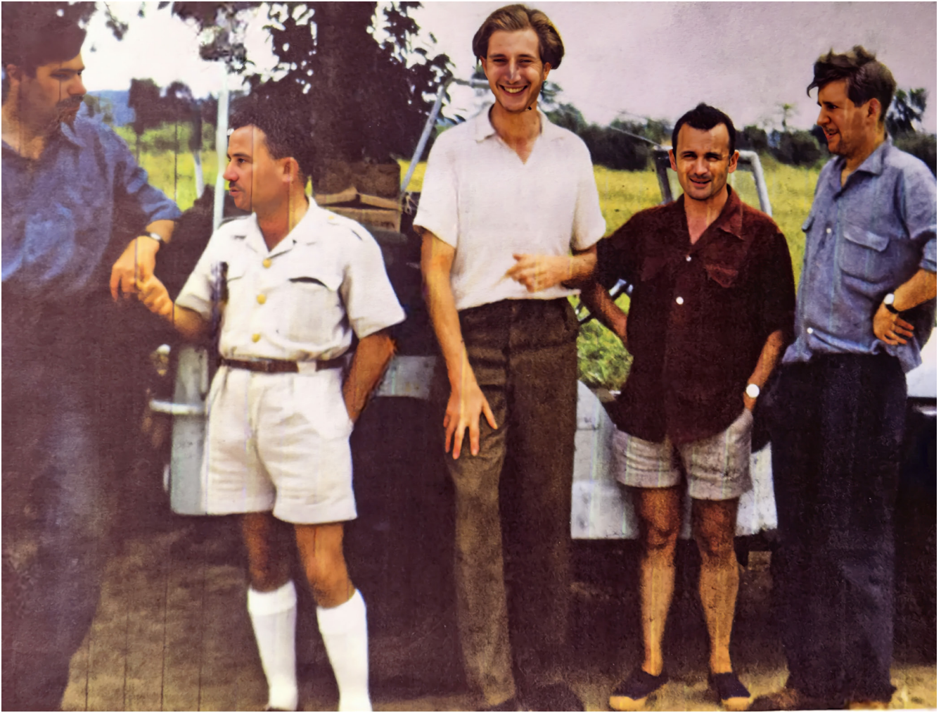
Figure 3. The 'Gabon Crew', from 1957. Guess which is Charles?!

Petersburg (then Leningrad) and Tashkent to study Bryonia and prepare a translation of a revised and augmented version of the second (1961) edition of Armen Leonovich Takhtajan's Origin of Angiosperm Plants (8). In 1977 he played a key role in securing for the Komarov Botanical Institute grants totalling $1 million for renovation of its herbarium and library building. Perhaps fittingly, his last publication was an obituary of Armen Takhtajan (9).