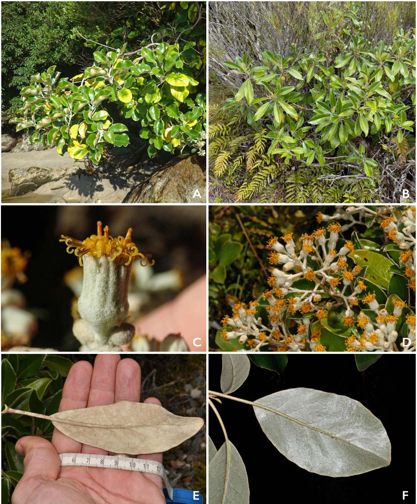
Figure 1. Diversity within Brachyglottis rotundifolia species complex. A. Coastal specimen, Stewart Island. B. Plant in exposed open habitat, Mt. Aspiring National Park, South Island. C. Capitulum, Stewart Island. D. Inflorescence, Otira Valley, South Island. E. Abaxial view of leaf of plant in forest habitat, Mount Aspiring National Park, South Island. F. Abaxial view of leaf in exposed open habitat, Mount Aspiring National Park, South Island.