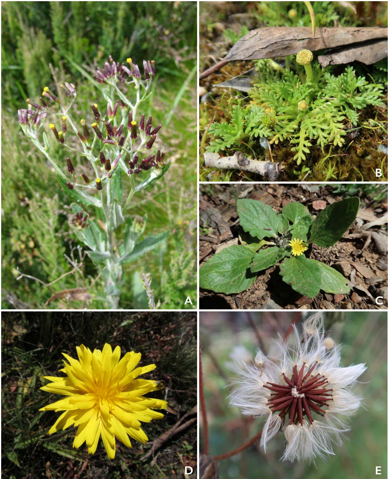
Figure 6. A. Senecio gunnii (Hook. f.) Belcher (Senecioneae). B. Cotula alpina (Hook. f.) Hook. f. (Anthemideae), Kosciuszko National Park, New South Wales. C. Cymbonotus sp. (Arctotideae), Australian Capital Territory. D. Microseris lanceolata (Walp.) Sch.Bip. (Cichorieae), New South Wales. E. Fruits of Picris angustifolia DC. (Cichorieae), Namadgi National Park, Australian Capital Territory.