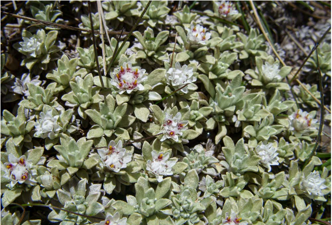
Figure 3. The Euchiton clade of Australian Gnaphalieae contains several alpine cushion plants, such as this Ewartia . Ewartia nubigena (F. Muell.) Beauverd in Kosciuszko National Park, New South Wales.

A molecular phylogeny of Brachyscome has long been available (Denda et al., 1999). Although its sampling was limited compared to the size of the genus, the results already demonstrated that Allittia , Pembertonia , and Roebuckiella are deeply nested in Brachyscome and constitute apomorphic segregates, even before they were in fact segregated. A more broadly sampled phylogenetic study of Brachyscome has recently been completed (Megan Hirst, unpubl. data.).