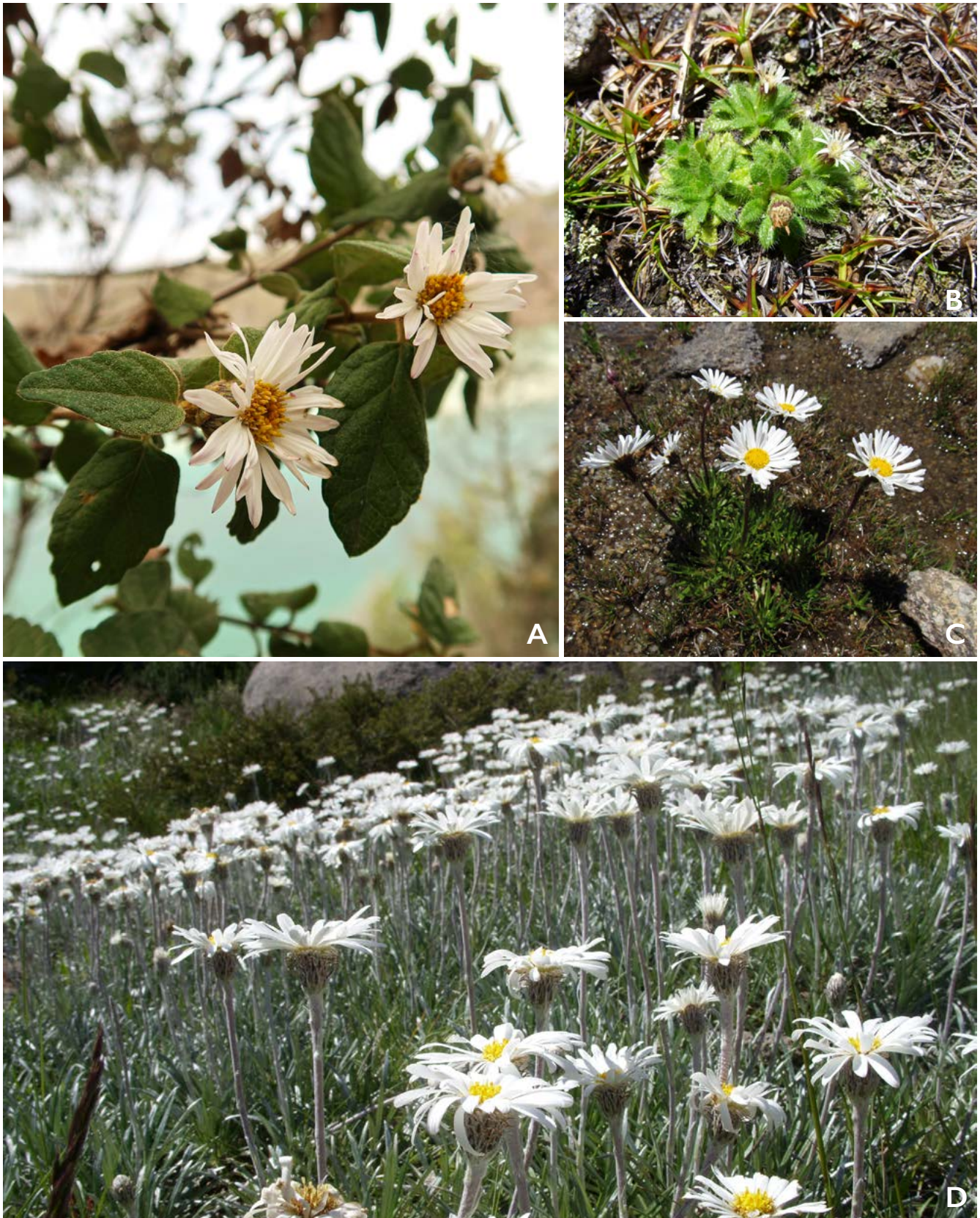
Figure 5. Australian Astereae. A. Olearia tomentosa (J.C.Wendl.) DC., coastal New South Wales. B. Pappochroma setosum (Benth.) G.L.Nesom. C. Brachyscome stolonifera G.L.Davis. D. Celimisa sp. in the alpine zone of Kosciuszko National Park, New South Wales, where Asteraceae constitute ca. 20% of the vascular flora.