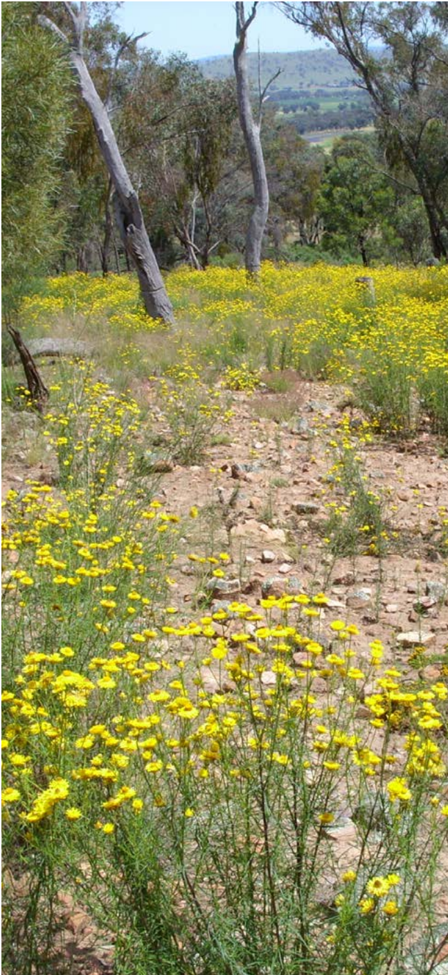
Figure 4. The genus Xerochrysum , commonly called the golden everlastings, is the horticulturally most important group of Australian native Asteraceae. Colorful hybrid variants are cultivated globally as cut-flowers. Xerochrysum viscosum (Sieber ex DC.) R.J.Bayer, mass-flowering in the Australian Capital Territory.

a new genus of alpine rosette plants, Scapisenecio Schmidt-Leb., and the expansion of previously monotypic Lordhowea B.Nord. (Schmidt-Lebuhn et al., 2020).