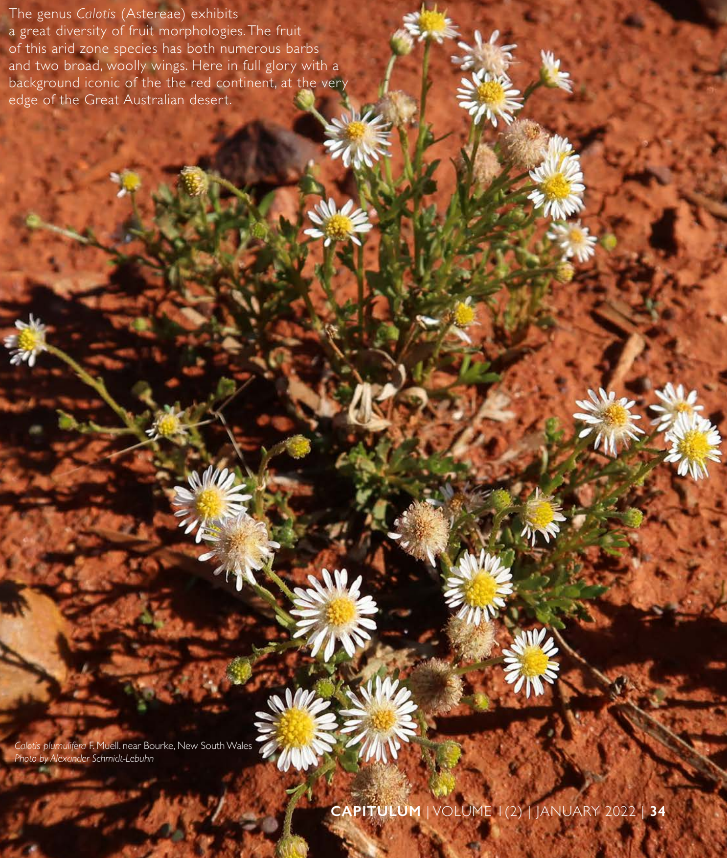
Calotis plumulifera F. Muell. near Bourke, New South Wales

The genus Calotis (Astereae) exhibits a great diversity of fruit morphologies. The fruit of this arid zone species has both numerous barbs and two broad, woolly wings. Here in full glory with a background iconic of the the red continent, at the very edge of the Great Australian desert.