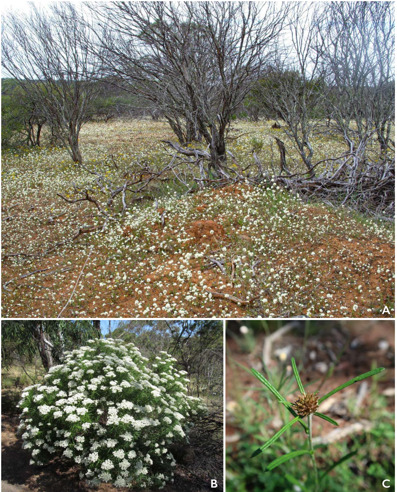
Figure 2. Australian Gnaphalieae. A. Cephalipterum drummondii A.Gray mass-flowering in Western Australia in spring. B. Cassinia longifolia R.Br., a representative of the woody Cassinia group. C. Euchiton sphaericus (Willd.) Holub in the Australian Capital Territory.